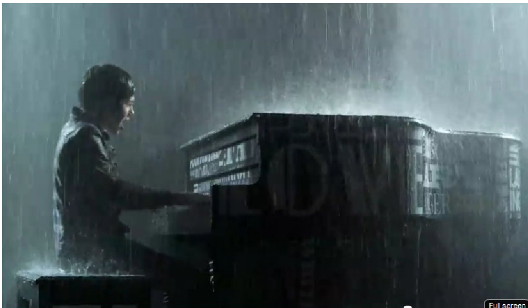
Greyson Chance in the video „Waiting Outside the Lines“