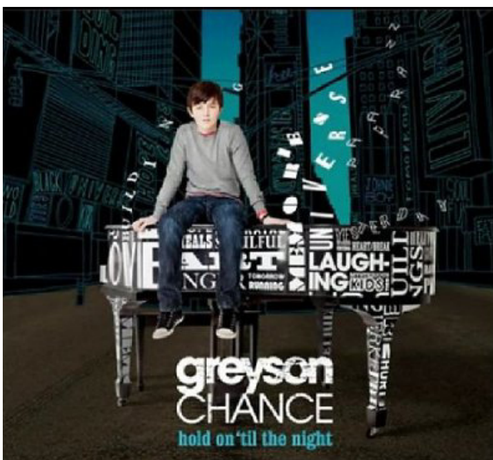
The cover of his album